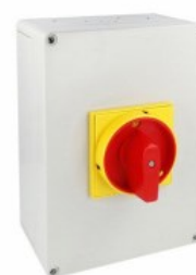
Enclosed rotary cam switch 7GN125