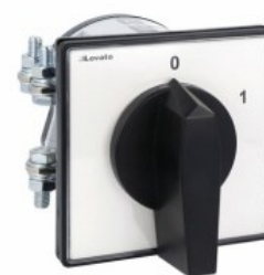
Rotary cam switches GN315