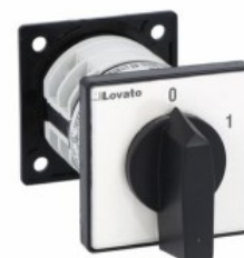
Rotary cam switches 7GN12