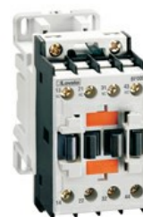
Auxiliary contactor BF00