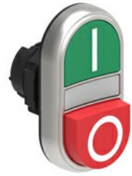
Double-touch actuators, spring return white indicator - One extended and one flush pushbuttons LPCBL72