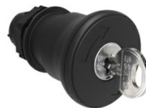
Mushroom head pushbutton, Latch, turn key to release Ø 40mm/1.6" LPCB684