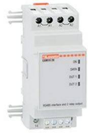
Expansion modules for modular products - communication port EXM1020