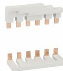
3P Rigid connecting kits for BF40...BF94 BFX3301