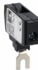
1P enlarged terminals. 1x6mm 2 for BF09...BF25 11G231