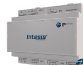
IN770AIR00*O000 Commercial and VRF 16/64 Indoor Units