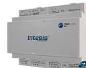
IN770AIR00*O000 Commercial and VRF Modbus RTU 16/64 Indoor Units