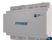
IN770AIR00*O000 Commercial and VRF 1 Indoor Unit