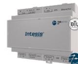
IN770AIR00*O000 Commercial and VRF BACnet/IP and MS/TP 16/64 Indoor Units