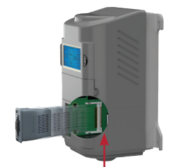
Anybus slot and 50-pin CompactFlash connector on the PCB of the host device