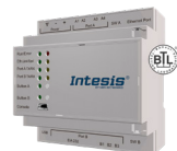
INBACACA004I000 Commercial and VRF BACnet/IP and MS/TP 4 Indoor Units