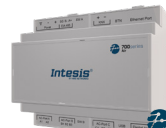
IN770AIR00*O000 City Multi systems Modbus TCP/RTU 50/100 Groups