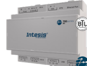
IN770AIR00*O000 City Multi systems BACnet/IP or MS/TP 50/100 Groups