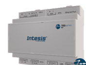
IN770AIR00*O000 City Multi systems 50/100 Groups