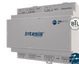
IN770AIR00*O000 VRF Systems BACnet/IP and MS/TP 16/64 Indoor Units