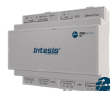
IN770AIR00*O000 VRF Systems Modbus TCP/RTU 16/64 Indoor Units